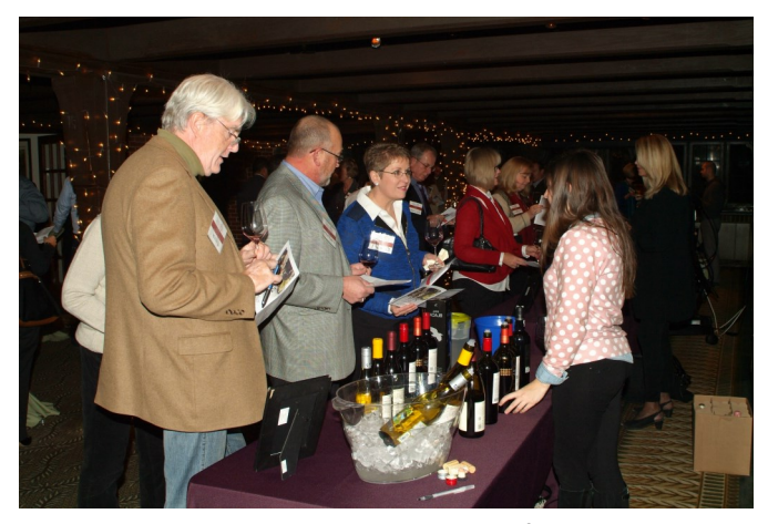
CHAD guest enjoy sampling a variety of wines